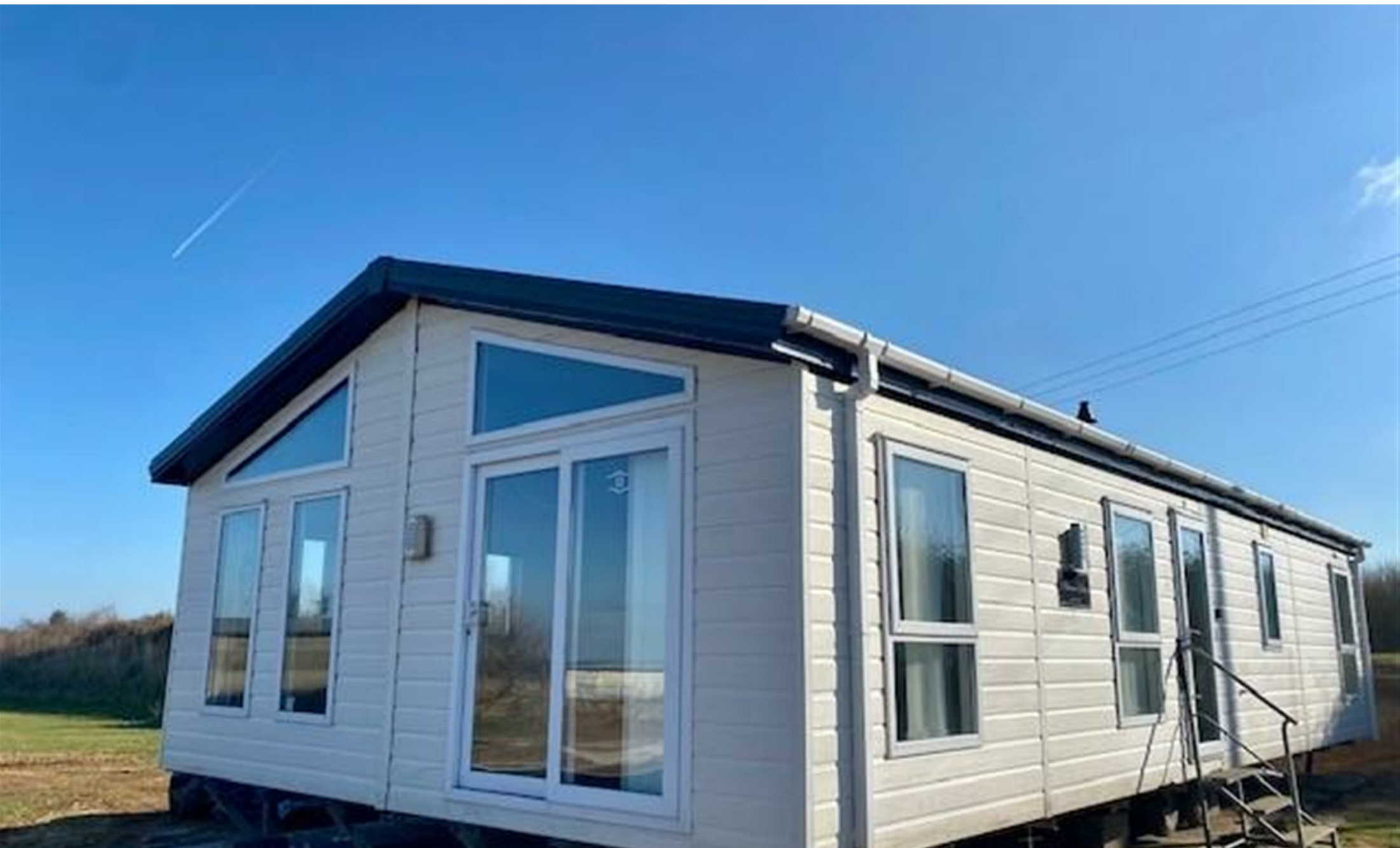
Trimingham Caravan Park | Norwich | NR11 Guide Price £90,000

Disclaimer – In accordance with the Property Misdescriptions Act, the company gives notice that all descriptions, references to condition, necessary permissions for use and other details are given in good faith and believed to be correct, but any intending lessees do not rely on them as statements of fact, but must satisfy themselves by inspection or other means, as to their accuracy.